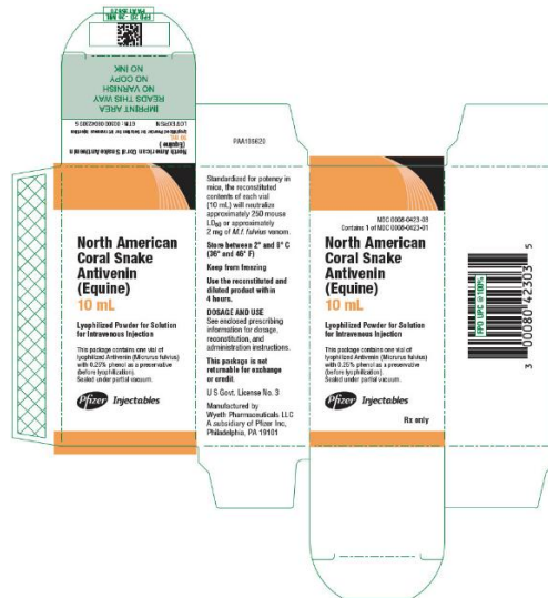
Figure 2. Carton